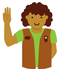
Brownies 2nd & 3rd

Girl Scout Daisies sparkle with that “first time ever” newness in everything they do. They go on trips, learn about nature and science and explore the arts and their communities—and so much more. Girl Scout Daisies can also earn Learning Petals and receive participation patches.