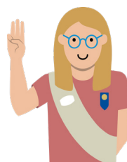
Ambassadors 11th & 12th

Girl Scout Seniors are ready to take the world by storm, and Girl Scouts gives them millions of ways to do it. Their experiences help to shape their world, while giving them a safe space to be themselves and explore their Interests. Girl Scout Seniors can earn their Gold Award (which, by the way, adds something ‘extra’ to college applications).