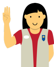
Seniors 9th & 10th

Girl Scout Cadettes chart their own course and let their curiosity and imagination lead the way. They learn about the power of being a good friend, gain confidence mentoring younger girls, and can earn the Silver Award.