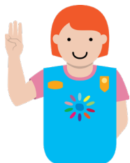
Daisies K & 1st

Girl Scout Daisies sparkle with that “first time ever” newness in everything they do. They go on trips, learn about nature and science and explore the arts and their communities—and so much more. Girl Scout Daisies can also earn Learning Petals and receive participation patches.