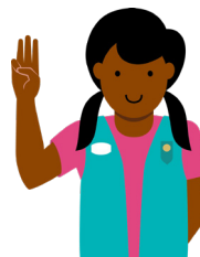
Juniors 4th & 5th

Girl Scout Brownies work together, earn badges, and explore their community. Friendship, fun, and age-appropriate activities begin at the Girl Scout Brownie meeting and move out to the community and wider world. While earning badges, they build skills, learn hobbies, and have fun!