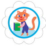
Cookie Goal Setter