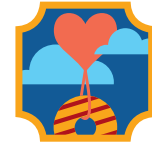
My Cookie Business Resume