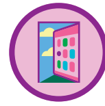
My Cookie Team