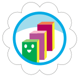
My First Cookie Business

2. Earn one of the Cookie Business badges to help you discover new skills. Each badge has digital marketing skills built right in.