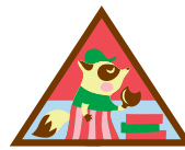
Cookie Decision Maker