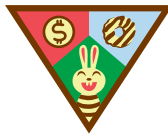
My Cookie Customers