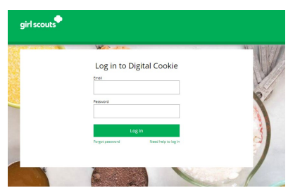
Step 4: Use your new password to log in. Remember to use the same email address where you received your registration email.

You will receive a registration confirmation email. Keep it somewhere handy during cookie season.